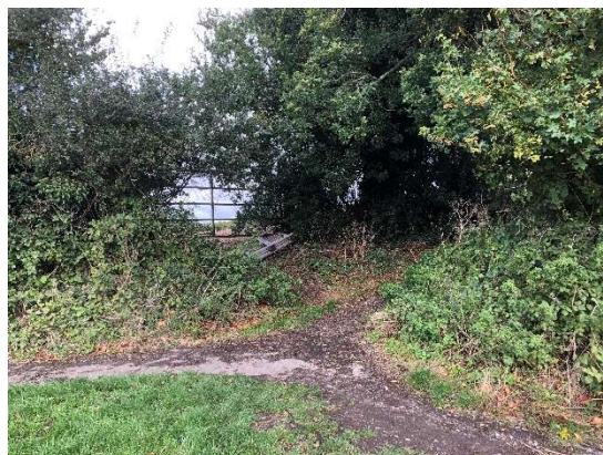
photo at start of footpath with gate to left